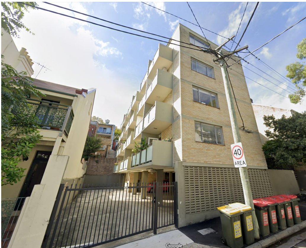
Figure 3. 100-104 Brougham Street looking east from Brougham Street