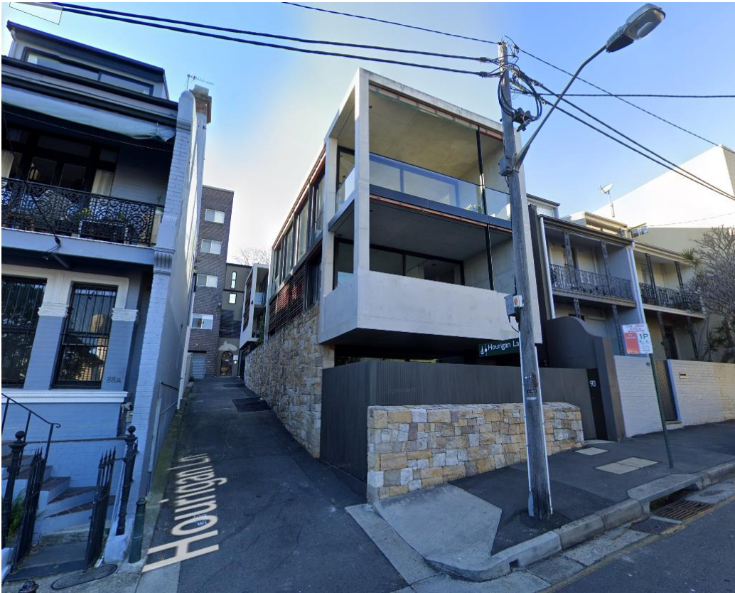
Figure 2. 90 Brougham Street looking east from Brougham Street